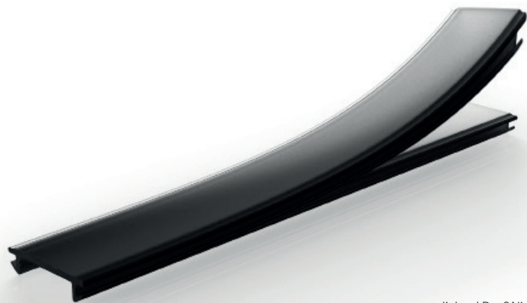
unlighted Day&Night FLEX-cover

RETONE FLEX Day&Night Black as night when unlighted – bright as day when artificially lighted.